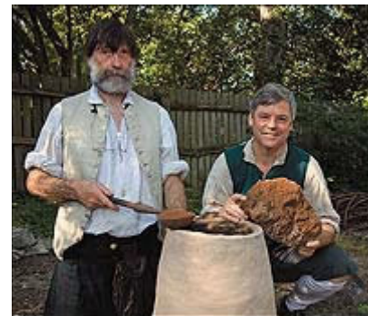
Holding Bog Iron Ore

Easton residents often understand the town's industrial history to begin with the discovery of "bog iron" which made Easton part of an important iron producing region in the late 17th and 18th century.